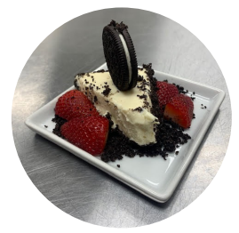
Fondation ECHO Foundation