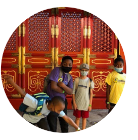
Government Gouvernement of Canada du Canada Canada